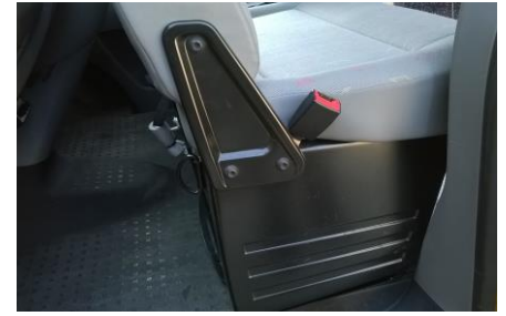
The seat view from the passenger door.