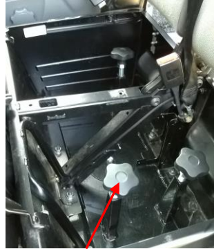
Lift the lid of the seat to access 3 of the hand wheels. Spin these until they release from the bottom plate. Lift over internal rib and position at an angle to aid rotation.