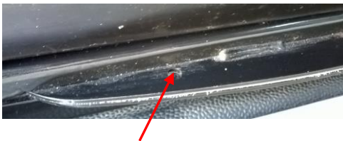
Line up the holes at the front on the curved edge, this will then line up all holes internally to allow it to be screwed back into position.