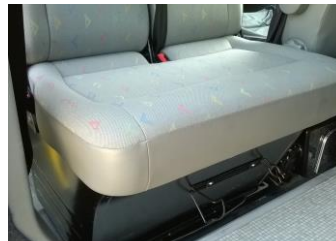
Once turned into position lift the lid again to access the hand wheels.