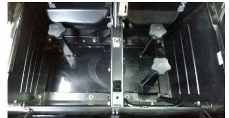
Lift hand wheels back into the vertical plane and screw the hand wheels back down to secure the seat into position.