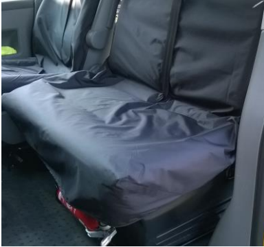
Double seat in its forward facing position.

The T5 double swivel sits underneath the existing double seat and allows the seat to be turned through 180 degrees to face into the rear of the vehicle and become part of the living area. The unit has been tested to comply with 76/115/EEC as amended by 2005/41/EC for M12 category when mounted on a rigid structure.