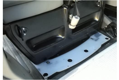
Start by pushing the set unit forward.