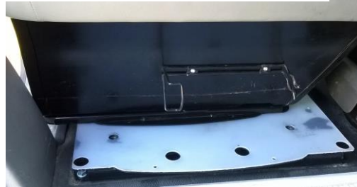
Then square it back up and move to the left.